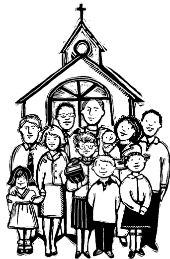
Our Church Family